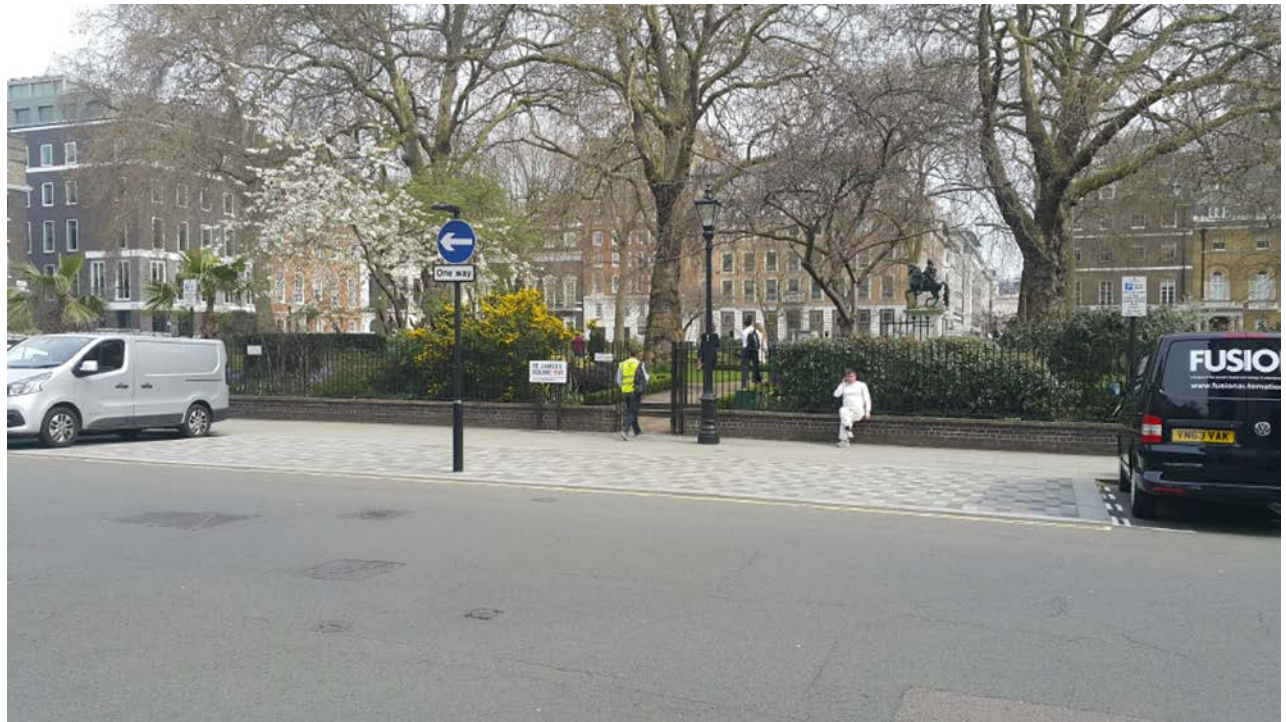
Footway on the south-west side of St James Square, opposite the junction with King Street